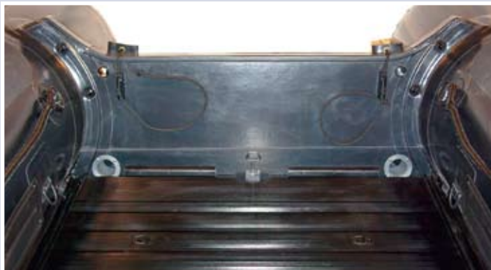
Standard aluminum deck, transom with high capacity scuppers, elephant trunk assemblies, interior deck drain access.