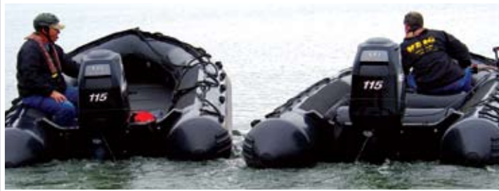
Select tiller-steering (left) or optional side console option (right).