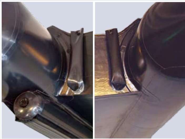
Main buoyancy tube with elephant trunk drain tube and optional speed tube (left). Standard configuration without speed tube (right).